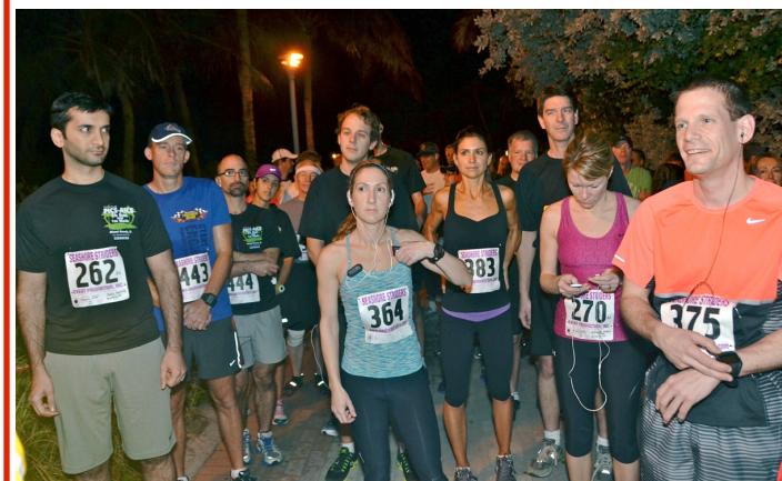
First PICS-AICS 5 km Run